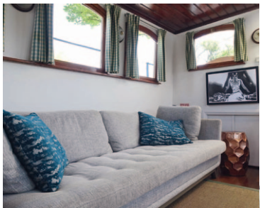
A comfortable living room