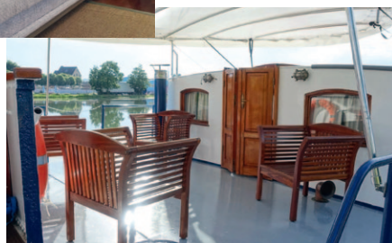
An intimate outdoor teak lounge