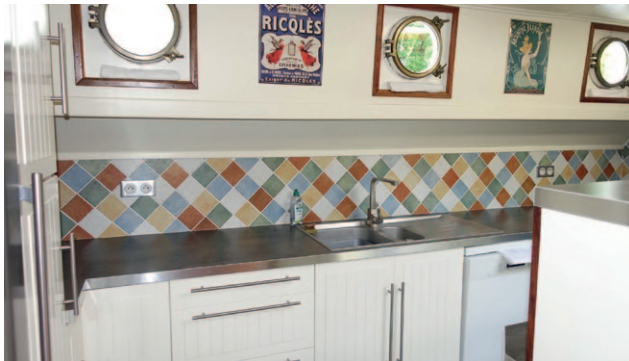
Well-equipped open-plan kitchen: dishwasher, microwave, fridge, freezer, complete set of dishes.